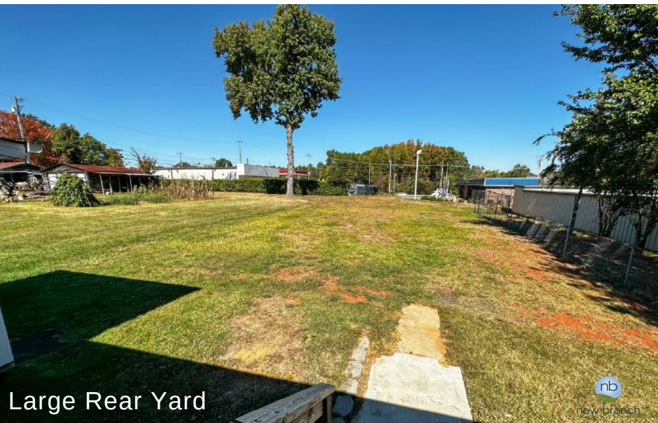
Large Rear Yard